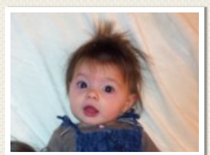
AVALINA (4 1/2 MOS)