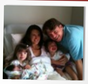
AVALINA IS BORN