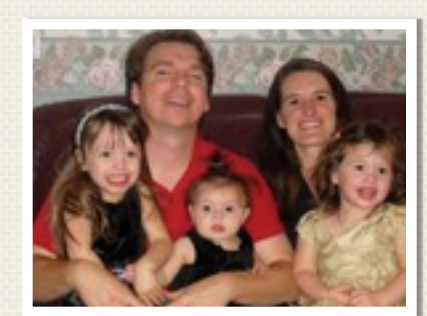
THE WHOLE GANG