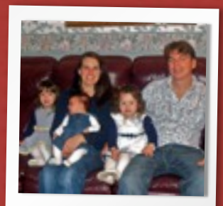
FAMILY OF 5