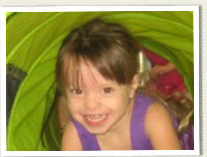
AMABELLA (35 MOS)